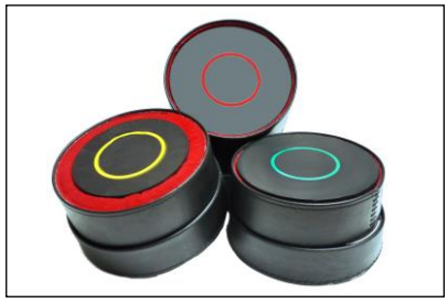
Conductivity Reference Pads