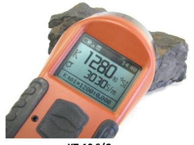
KT-10 S/C (Circular Coil)