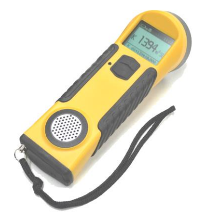
KT-10 v2 Magnetic Susceptibility Meter (Circular Coil)