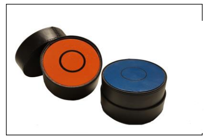
Magnetic Susceptibility Calibration Pads