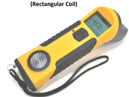
KT-10 v2 (Rectangular Coil)