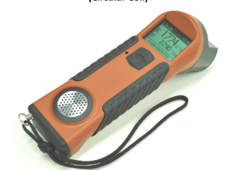
KT-10 S/C Magnetic Susceptibility/Conductivity Meter