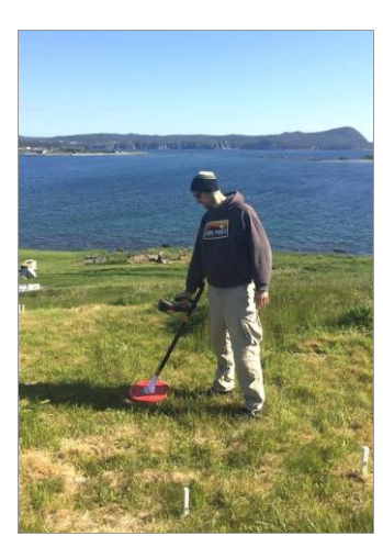
3F-32 Large Diameter Sensor