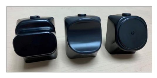
Rectangular, Curved and Circular Sensor Shapes