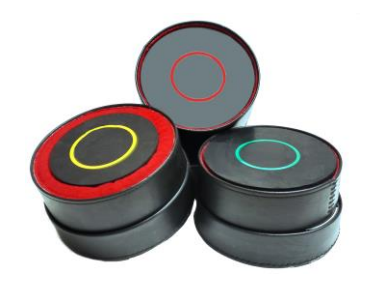
Flat Conductivity Reference Pads