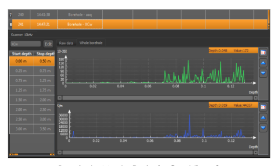
Borehole Mode Data in GeoView 2