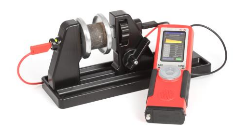
IP/Resistivity Module with Small Sample Holder