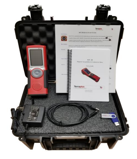
KT-20 Contents in Shipping Case