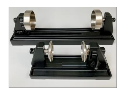
Small and Large Sample Holders for IP/Resistivity Module